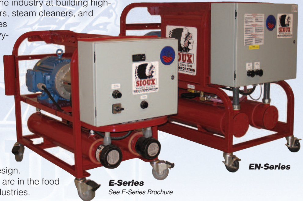
E-Series See E-Series Brochure

There are many other applications that either the E or EN-Series can be used; this is only a general guide. For a recommendation on exactly which model is best for you, please consult a Sioux representative to discuss your needs and your application.